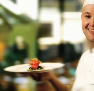
CASUALLY INVITING YOUR PROFESSIONAL COLLEAGUES TO MEET IN VANCOUVER IS ONE THING ... ACTUALLY HOSTING THE MEETING IS ANOTHER.

We'll supply Vancouver guides and maps to conference delegates free of charge