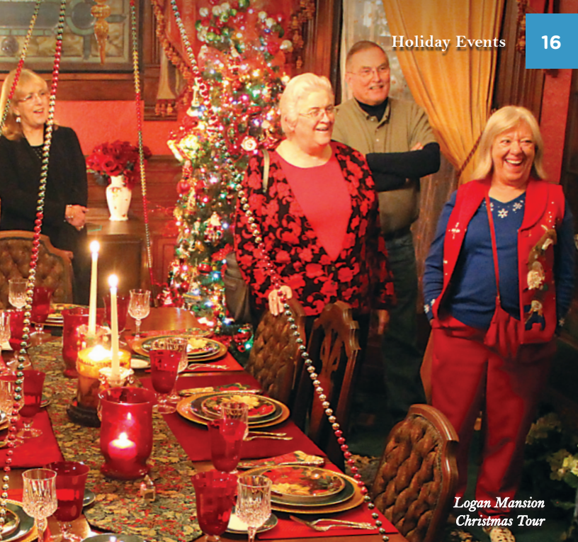
Logan Mansion Christmas Tour