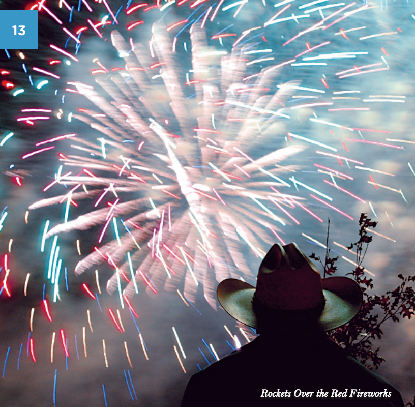
Rockets Over the Red Fireworks