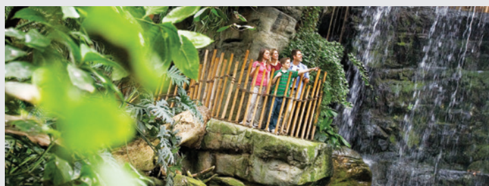
Omaha's Henry Doorly Zoo & Aquarium