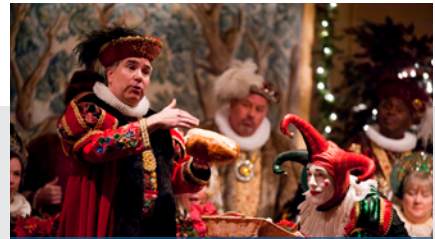
Madrigal Christmasset Feaste