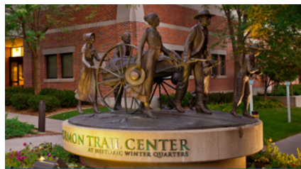
Mormon Trail Center