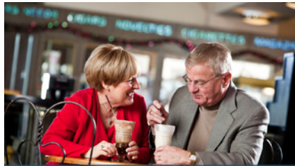
The Durham Museum