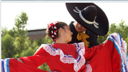
Mexican Folk Dancers