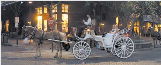
Omaha's Old Market entertainment district

Contact: Bill Slovinski bslovinski@visitomaha.com (402) 444-1760