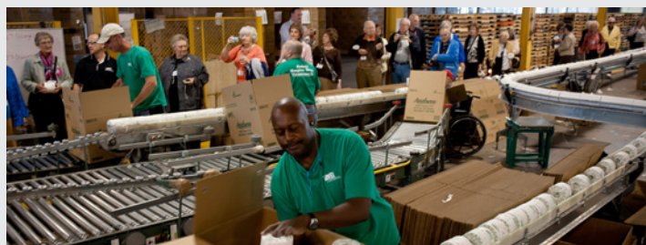
Toilet Paper Factory