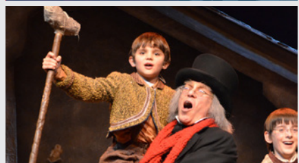
A Christmas Carol Musical