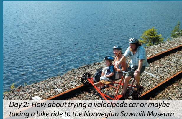
Day 2: How about trying a velopedede car or maybe taking a bike ride to the Norwegian Sawmill Museum