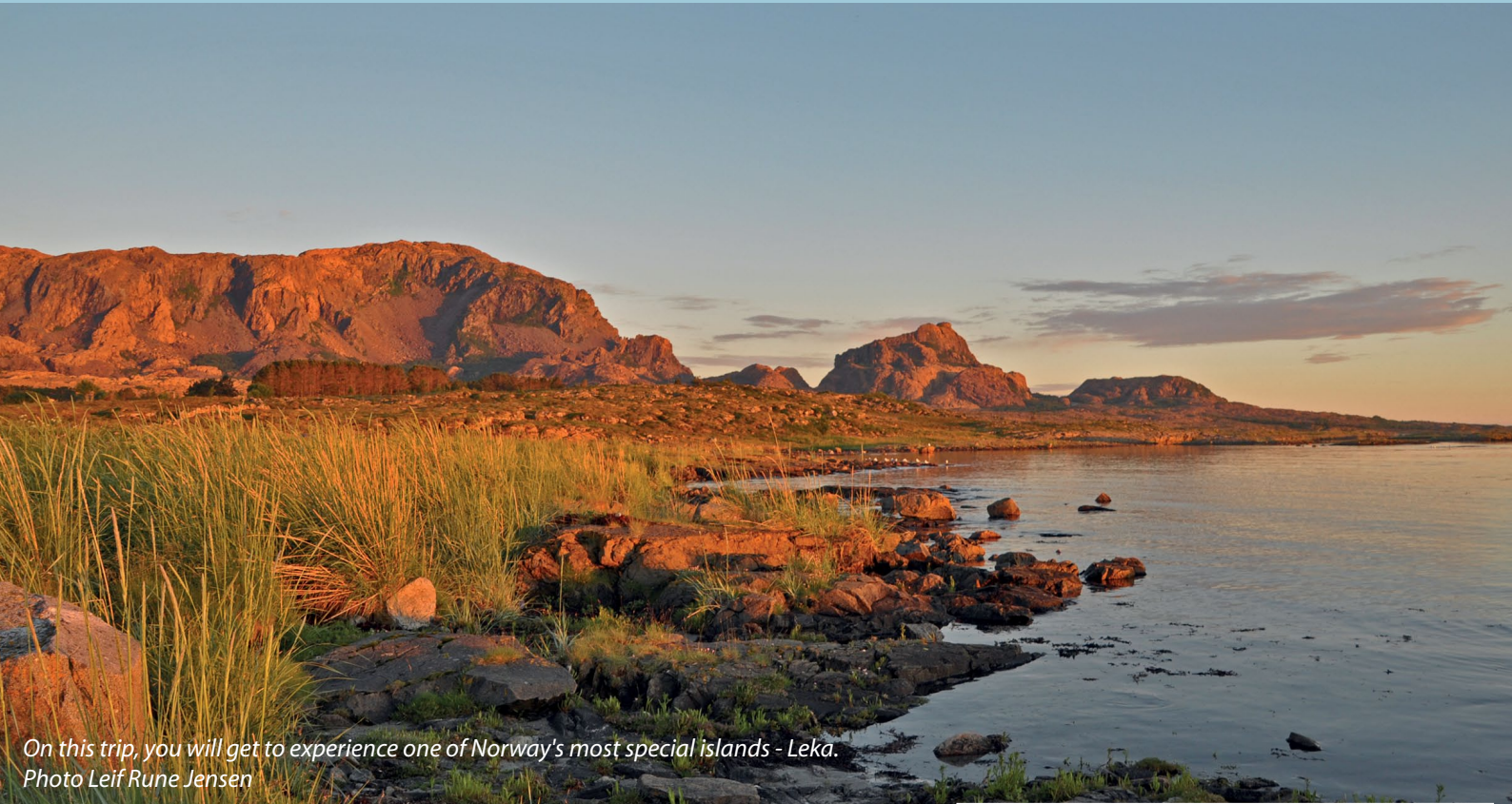
On this trip, you will get to experience one of Norway's most special islands - Leka.

Experience Norway's most exciting and spectacular island - Leka, beautiful Abelvær, and the protected fishing village of Sør-Gjæslingan. In this suggested tour, which can be done in 4-6 days, you hop from highlight to highlight along the Namdal Coast.