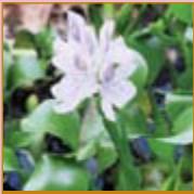
Water Hyacinth (naturalized – invasive)