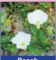
Beach Morning Glory