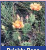
Prickly Pear Cactus