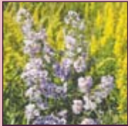
Asters (native & some naturalized species)