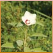
Woolly Rose Mallow