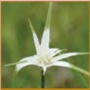
White Topped Sedge