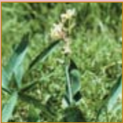
Canna Lily (native & some naturalized species)