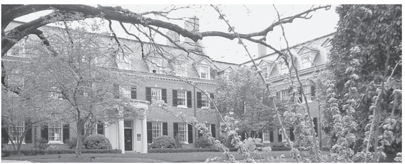
The Carolina Inn is a fixture in Chapel Hill, N.C., and features food and music on the front porch beginning in April each year.