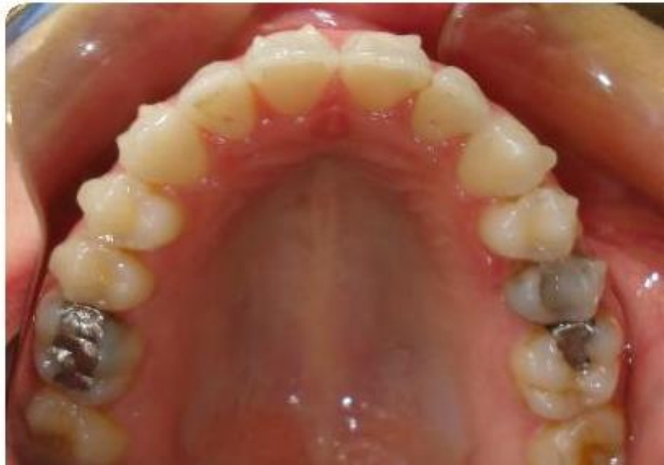
Stage 22 5.5 months